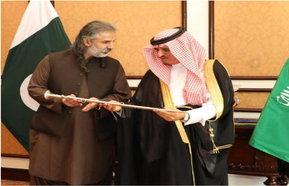
The Federal Minister for Narcotics Control, Nawabzada Shahzain Bugti presenting a souvenir to Saudi Deputy Interior Minister H.E. Dr Nasser Bin Abdul Aziz Al Dawood in their meeting in Serena Hotels Islamabad, on the 17th of May 2023