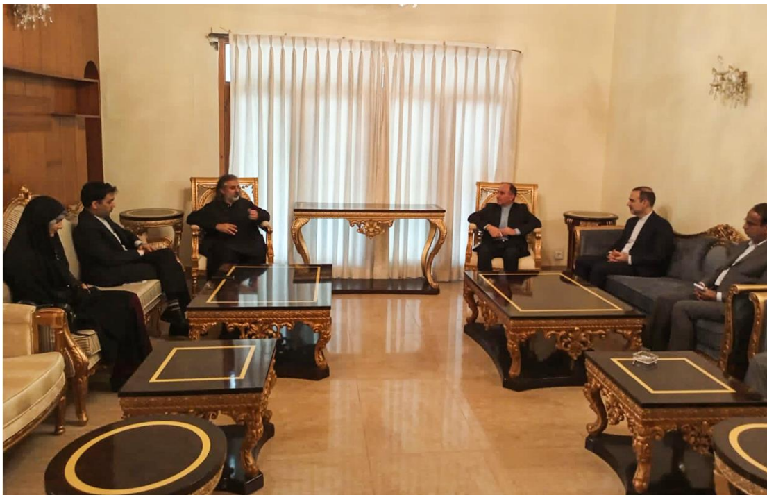
Federal Minister for Narcotics Control Nawabzada Shazin Bugti in honor of Mr. Nabi Shirazi and the Iranian delegation. The meeting also discussed mutual affairs and cooperation between Pakistan and Iran regarding narcotics control on 31-May-2023