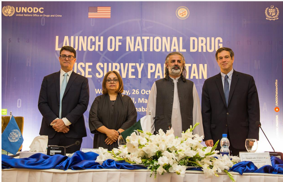
National Drug Use Survey for Pakistan was launched on 26/10/2022