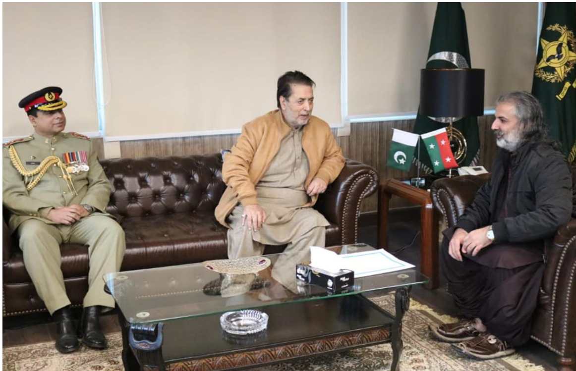
Governor GilGit Baltistan Syed Mehdi Shah called on Federal Minister for Narcotics Control Nawabzada Shazain Bugti in his office Islamabad