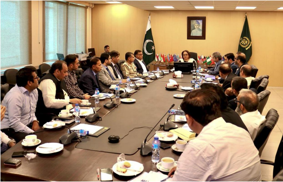
Federal Secretary Minister of Narcotics Control Headed an Interactive Section with Representative of Chemical Industries