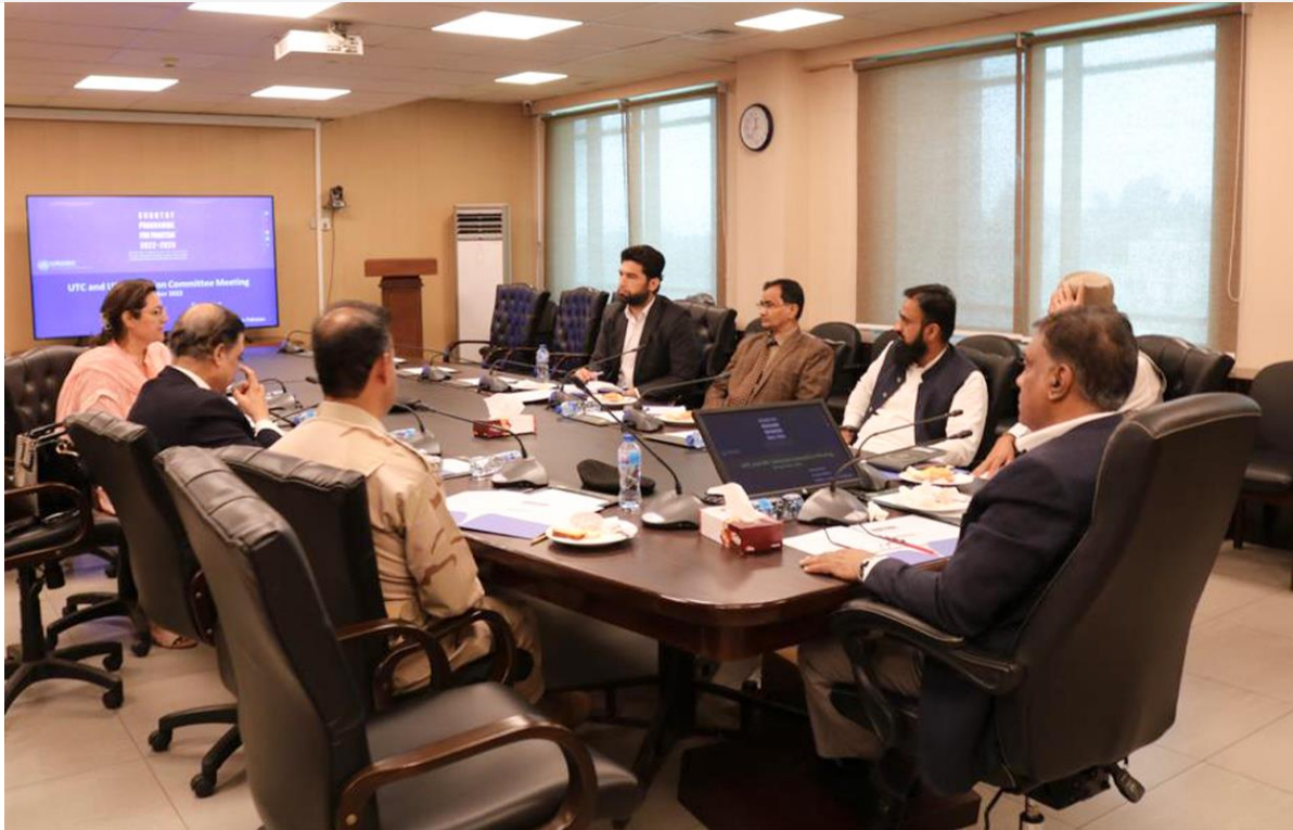
Meeting to Discuss Progress on Universal Prevention Curriculum in Liaison with UNODC