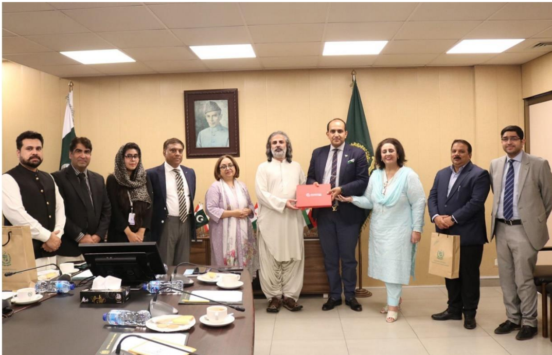
Minister for Narcotics Control held a meeting with Roots international schools and colleges and matters related to drug awareness among students were discussed