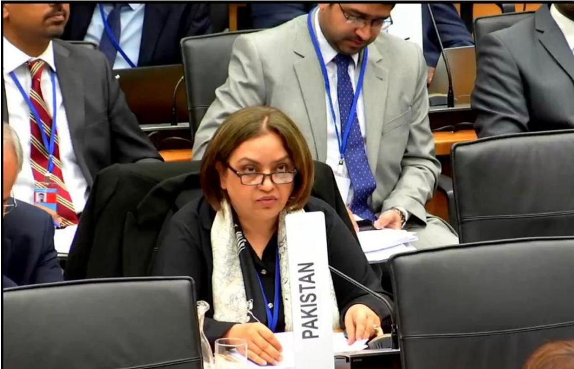
Secretary for Narcotics Control issuing country statement at Commission on Narcotic Drugs Intersessional