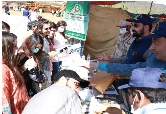
MNC displayed a stall at the fun fair in Quaid-i-Azam University, Islamabad on 02-03-2021