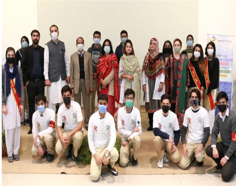
Seminar in Beaconhouse Educational Complex, G-15/3, Islamabad on 17-02-2021