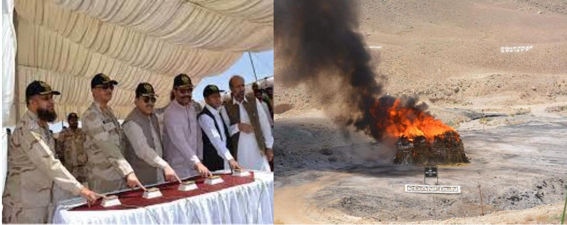
Mr. Akbar Durrani, Secretary MNC alongwith DG (ANF), RD Balochistan and notables, igniting 42 tonnes of drugs and 275 bottles of liquor

Federal Minister for Narcotics Control, was addressing the audience at D Chowk awareness walk on 26-06-2021