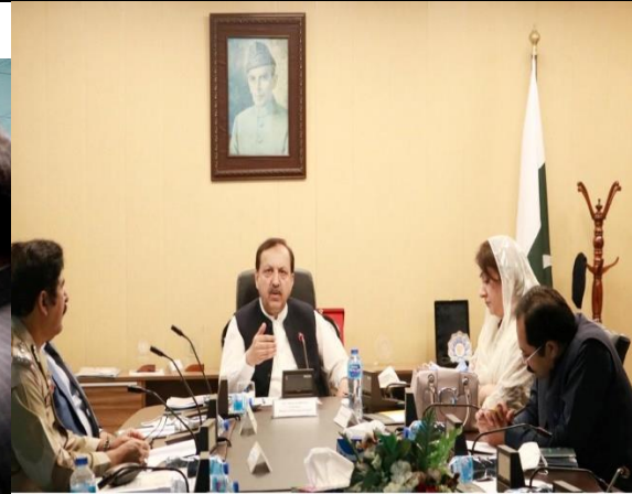
FEDERAL MINISTER FOR NARCOTICS CONTROL, BRIG (R) IJAZ AHMAD SHAH INAUGURATED THE DAY CARE CENTRE AT THE MINISTRY OF NARCOTICS CONTROL IN ISLAMABAD ON MARCH 17, 2021.